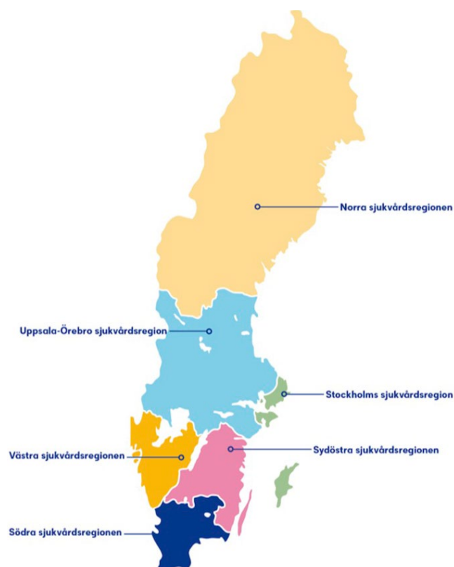
FIGURE 1. Map of Sweden, showing catchment area for the Neurosurgical Department at Uppsala University Hospital highlighted in blue. The population in the region during the study was 2 million inhabitants, with 270,123 (2010) persons in the age group of interest.

More than half of the patients (57.3%) were living with a partner or other person at the time of the surgery; 43 (8.4%) lived in a nursing home, and 175 (34.3%) lived alone. Twenty-one patients (4.1%) had an excessive use of alcohol,